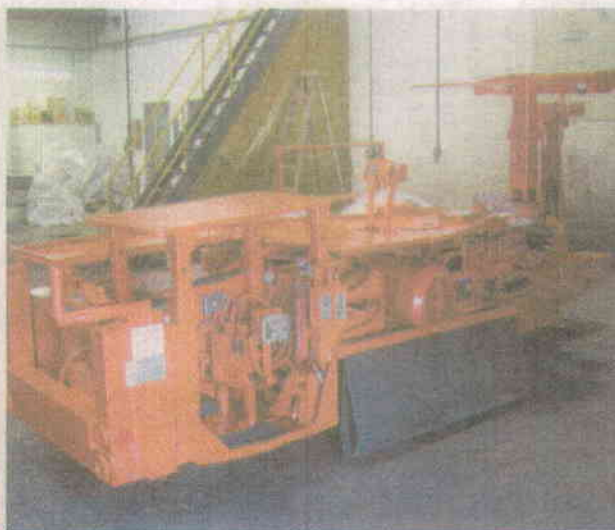
Fig 2 Rebuilt Roof Bolter