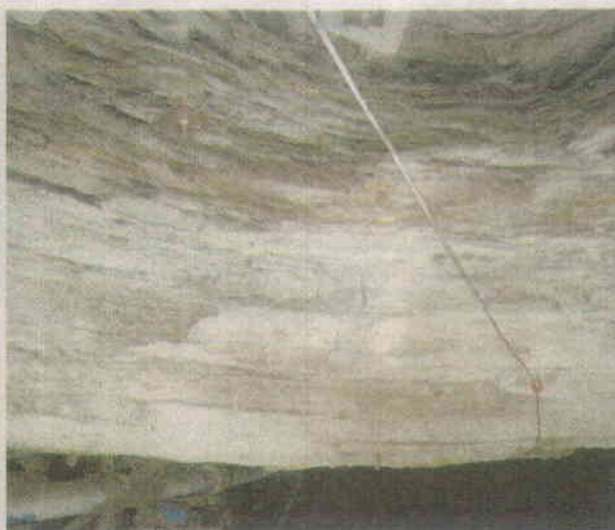
Fig 5 Roof Fall Area