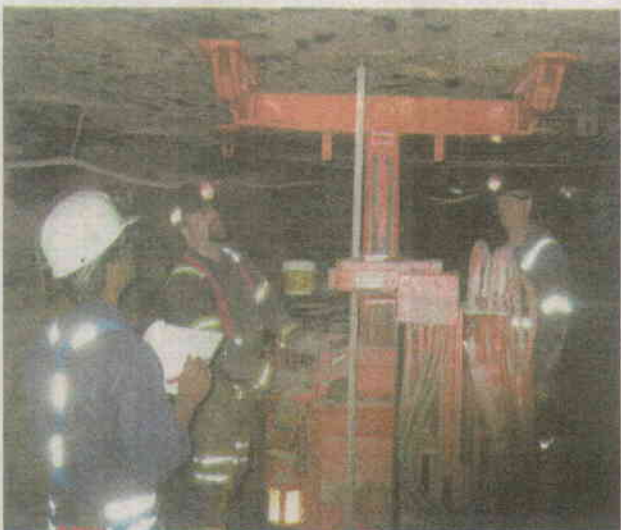
Fig 4 Testing in the Mine