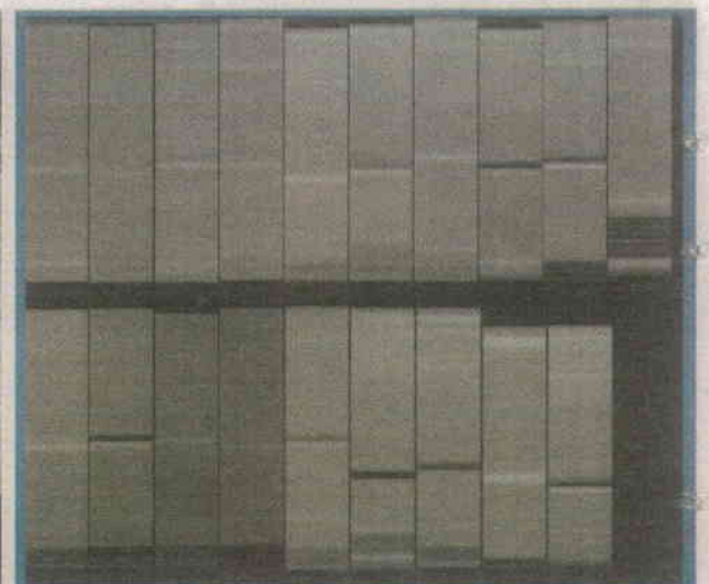
Fig 6 Discontinuity Trends