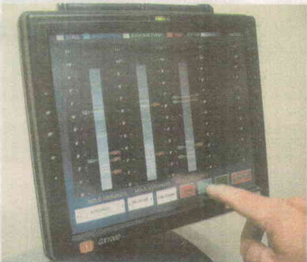
Fig 1 Fletcher Information Display

It was concluded that no one method shows everything and the system needs to be adjusted for individual machines and mine conditions. Looking at trends gives a more accurate picture than individual data samples. The Fletcher Information Display is an ongoing research and development project that is still evolving.