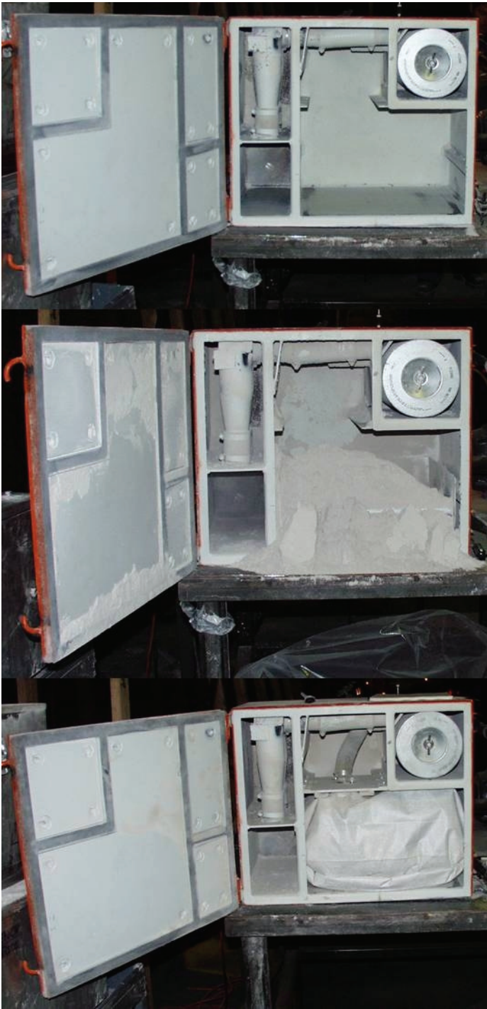
Figure 1.—Condition of main chamber before test (top), after test without bag (center), and after test with bag (bottom – note retrofit kit installed).